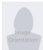
INSIDE LEFT PANEL ( when folded )

PsPrint is not responsible for reprinting your job if this layer is included in your file