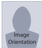
INSIDE LEFT PANEL ( when folded )

You MUST delete this layer or it will be printed in your finished product.